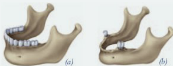
Bone is maintained by the presence of natural teeth or implants (a). Bone loss occurs with the loss of teeth (b).