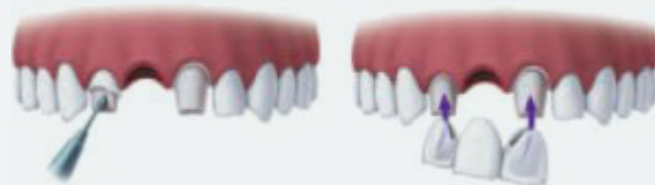
Fixed bridges may require the shaping or cutting down of adjacent healthy teeth.